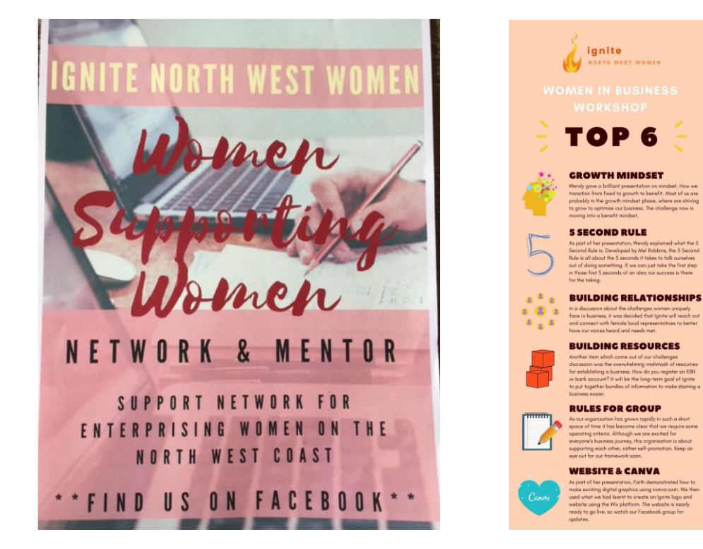
Figure Four: Ignite North West Women Flier and Women in Business Workshop Output

Figure Five: Excerpts from Adobe Spark Presentation – Workshop Findings and Invitation to Co-Design Workshops Full presentation available at: <u>https://spark.adobe.com/page/KaN0JkB1Jch0g/</u>