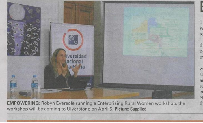
Figure Two: Local media uptake From The Advocate , Saturday, March 31<sup>st</sup> 2018